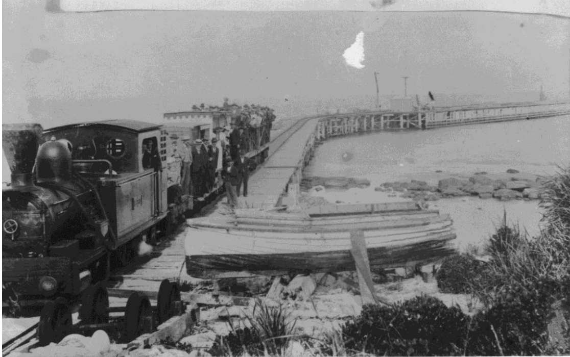
Passengers aboard locomotive at Point Samson jetty