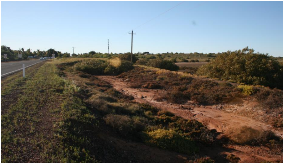
A section of raised track foundation at Point Samson, 2012