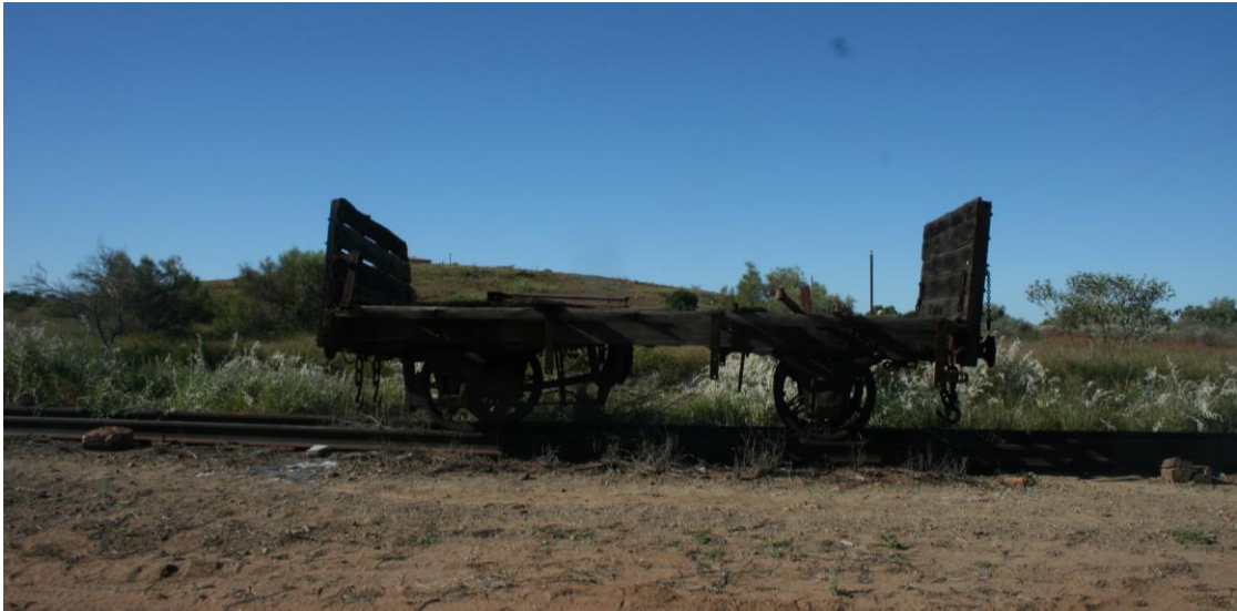
Unrelated rolling stock on reconstructed rails at Cossack, 2012